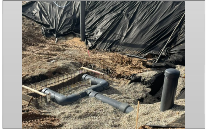
Deep end main drain system being run and clear stone installed