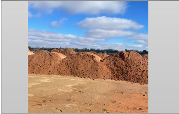
Baseball infield material stockpile and ready to spread once outfield topsoil is finished