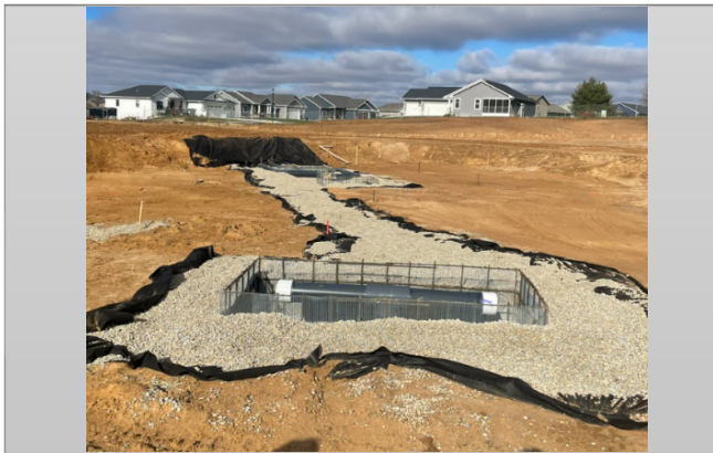
Upper shallow end of pool main drains being installed