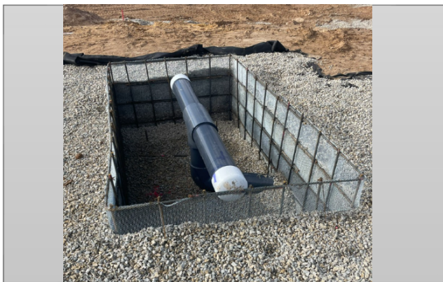
Drain basin awaiting drains to be delivered